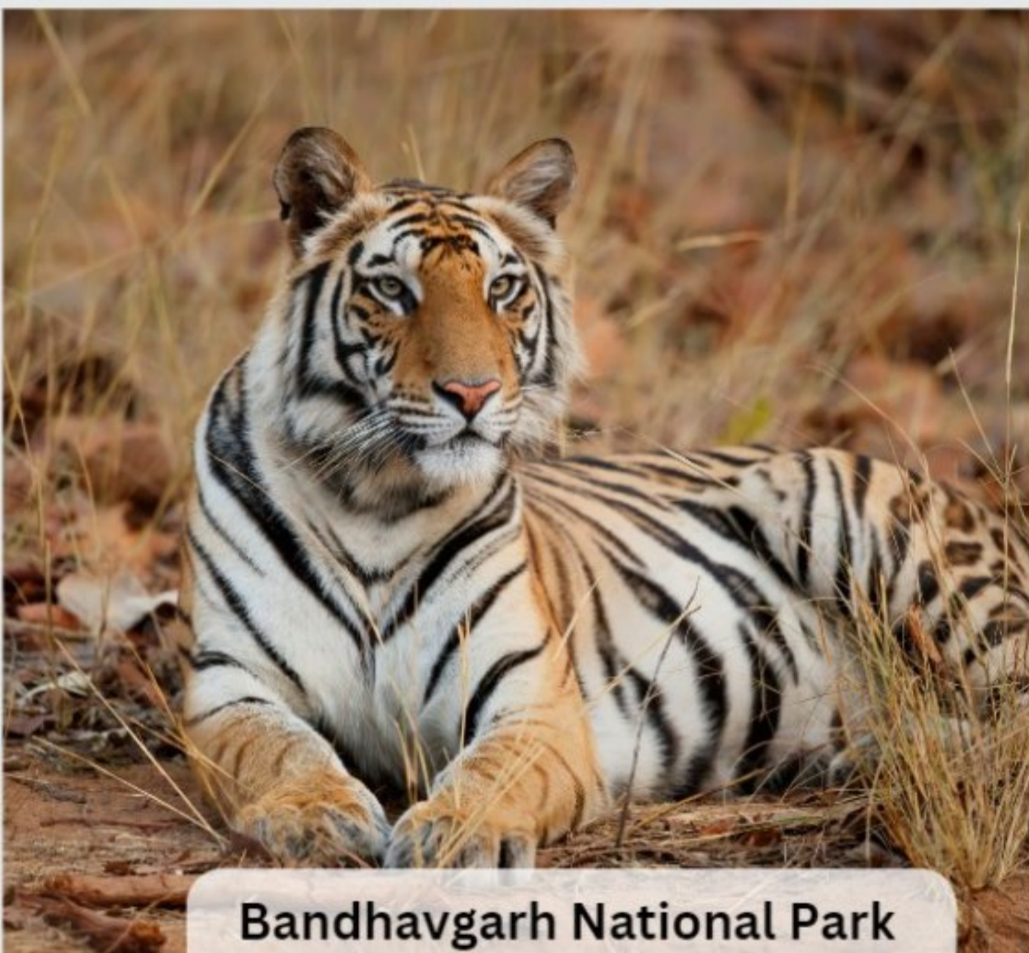
Bandhavgarh National Park